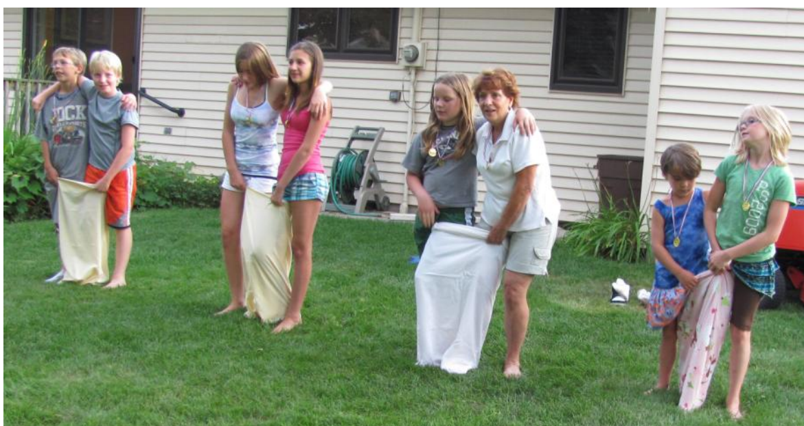
The duos get ready to hop their way onto the field during the pillowcase race