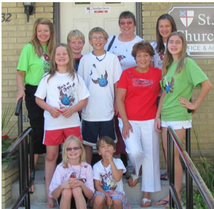
Everyone wore their T-shirts to church Sunday morning